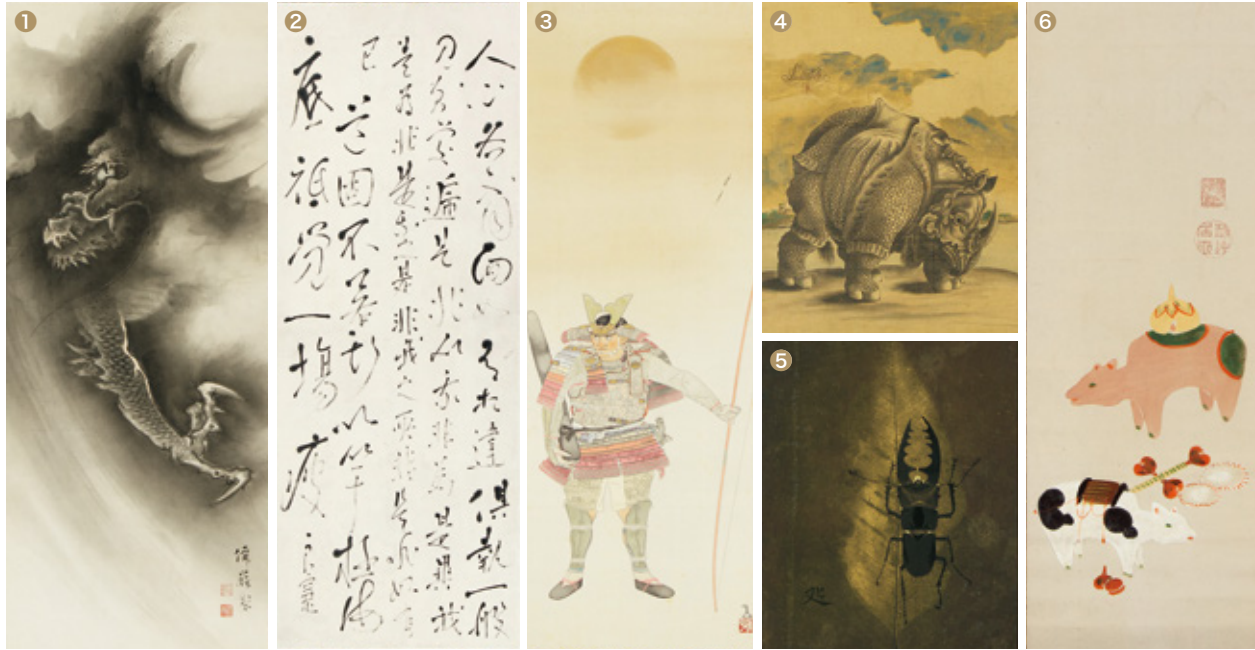
① Maruyama Okyo, “Dragon in Clouds” ¥8,000,000 Slight color on paper Image 130×50cm / Overall 224×65cm