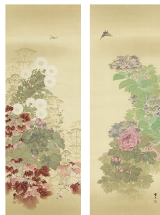
Kimura Buzan, Spring and Autumn Starting Bid: ¥1,800,000

Kimura Buzan is one of the leading masters of the Modern Japanese painting. Under Okakura Tenshin, he worked with Yokoyama Taikan, Shimomura Kanzan, and Hishida Shunso to modernize Japanese painting, and left his mark as one of the most highly acclaimed Japanese artist. In contrast to Taikan and his contemporaries, who sought a novel and innovative style, Buzan maintained a conventional approach based on the classics throughout his life, excelling in traditional subjects. This MEGURU will feature 16 works, including magnificent and exquisite flower-and-bird paintings and Buddhist paintings.