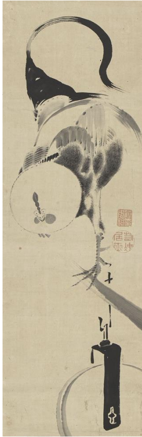
Ito Jakuchu, Rooster and Well Bucket Starting Bid: ¥2,000,000