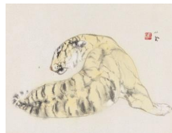
Takeuchi Seiho, Tiger Starting Bid: ¥2,000,000

Takeuchi Seiho led the Kyoto art scene from the Meiji to the Showa era, and together with Yokoyama Taikan, contributed to the modernization of Japanese painting. Seiho introduced Western realism to the traditional techniques of the Maruyama Shijo School, opening up a new dimension in Japanese painting. Seiho's greatest forte was his animal paintings, such as "Puppy" and "Tiger". In this MEGURU, we are pleased to present 17 diverse pieces that still exude fresh appeal.