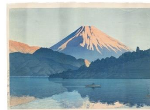
Kawase Hasui, Hakone Lake Ashi Starting Bid: ¥350,000