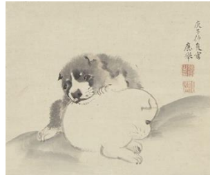
Maruyama Okyo, Puppies Starting Bid: ¥2,500,000