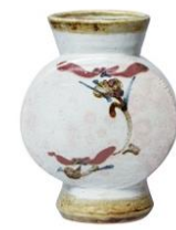
Kawai Kanjiro, Flat Pot with Flowering Plant Pattern Starting Bid: ¥900,000