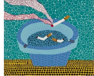
Kusama Yayoi, Ashtray Starting Bid: ¥2,500,000