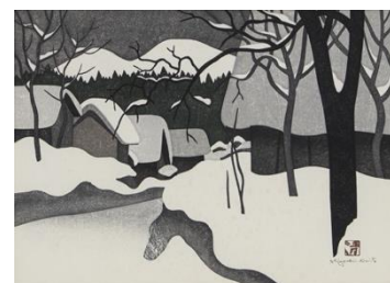
Saito Kiyoshi, WINTER IN AIZU(36) Starting Bid: ¥200,000

Saito Kiyoshi was internationally acclaimed for his modern style that incorporated a Western sense of form into the traditional beauty of Japan, and actively supported the early days of modern Japanese printmaking. Starting with an award at the Sao Paulo Biennale in 1951, Saito continued to exhibit abroad until his later years, and his works are in the collections of such prestigious museums as the Museum of Modern Art in New York and the Museum of Fine Arts, Boston. This MEGURU will feature total of 20 works, mainly landscapes, including the "Winter in Aizu" series depicting his hometown.