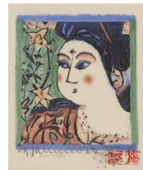
Munakata Shiko, Princess Kuchinashi Starting Bid: ¥3,800,000