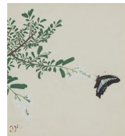
Tanaka Isson, Common Bluebottle Starting Bid: ¥1,250,000