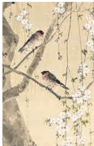
Weeping Cherry with Bullfinches