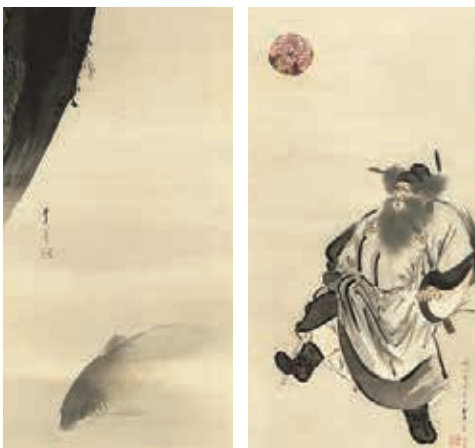
Shōki, the Demon Queller; Carp