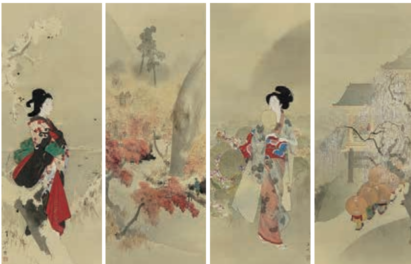
Famous Places of Edo in the Four Seasons

Get up close and personal with approximately 30 magnificent works, with a focus on the 24 masterpieces featured in the "WATANABE SEITEI" art book. Among them, you'll find notable works such as the Picture Album of Historical Figures believed to be one of Seitei's earliest works and exhibited at The University Art Museum, Tokyo University of the Arts exhibition "Watanabe Seitei Brilliant Birds, Captivating Flowers". Also featured is the Ryuzu Kannon (Dragon-Riding Kannon) which graces the cover, and the elegant depiction of the four seasons in Ueno titled Famous Places of Edo in the Four Seasons alongside other renowned works like Weeping Cherry with Bullfinches and Shōki, the Demon Queller; Carp .