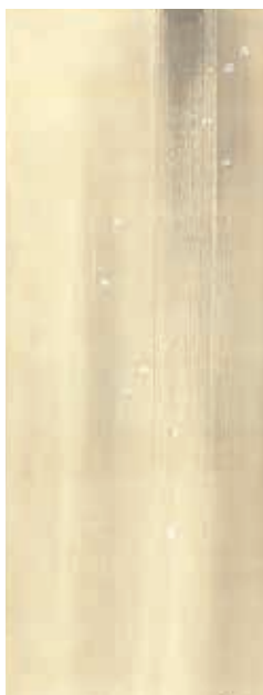
Doll Festival (Hinamatsuri)