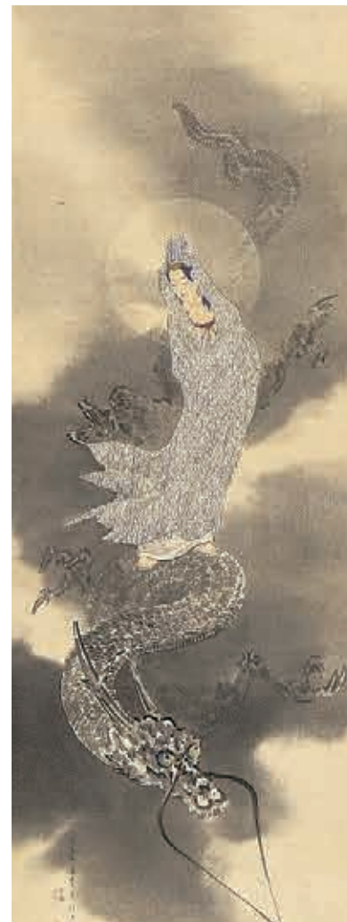
Ryūzu Kannon (Dragon-Riding Kannon)